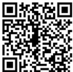
Youth Enrollment Form

The new 4-H year has begun! All youths and volunteers need to “re-enroll” at the beginning of each program year, and since we are transitioning to an online system this year, we have scheduled four Enrollment Events (two via Zoom and two in-person) to guide you through the process. During each session, we will randomly select a family to receive a free enrollment for the upcoming year. Please bring a laptop, phone, or other electronic device. We look forward to seeing you soon!